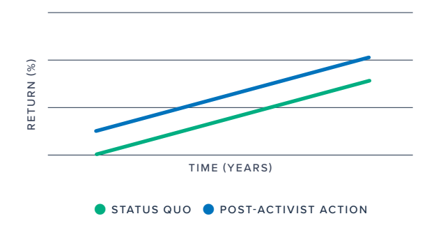
Figure 3. Increasing Long-term Value

Notably, we could not find academic evidence of long-term value creation by activists. By contrast, academic research more clearly demonstrates that activist hedge funds almost exclusively prefer shorter-term returns. Activist hedge funds represent an extreme among shareholders in discounting future cash flows more heavily than other shareholders, due to the greater uncertainty of valuing long-term outcomes within their shorter time horizons.27 This, in turn, may shorten corporate time horizons, thereby triggering corporate executives and boards to prioritize actions that yield more immediate financial returns at the expense of greater long-term value creation. Indeed, activists could increase long-term value in some situations, but often opt to "bring earnings forward" instead.